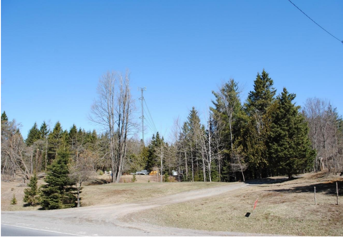
Figure 2 – Photo Simulation